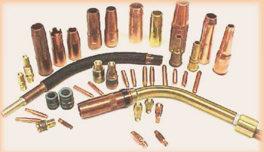
Examples of How our Tubing is Used