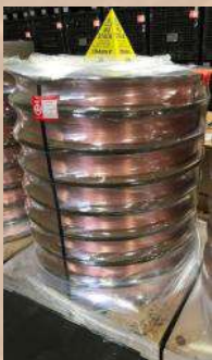
Level Wound Coils