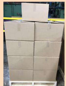
Pancake Coil Packaging